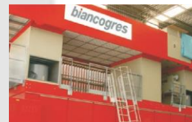
BIANCOGRES 10.2 MW – Vitória/Brazil 2013