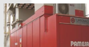
PAMESA DO BRASIL 4.5 MW – Recife/Brazil 2006

Among our customers, are included companies in the following segments: Automotive, Chemicals, Colleges & Universities, Commercial Real Estate, Food & Beverage, Glass, Health Care Facilities, Metals, Paper & Packaging, Pharmaceutical and Plastics.