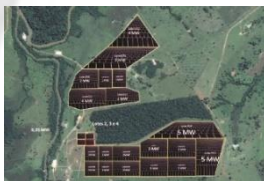
PV SOLAR FARM 51 MW