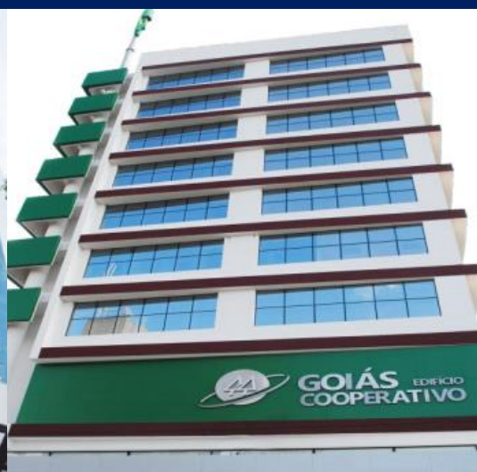
Goiânia/GO Office, Brazil Av. Dep. Jamel Cecílio, Nº3527, Sala 703, Ed. Goiás Cooperativo. Q C-9, Lote 10, JD. Goiás, Goiânia-GO | CEP: 74810-100 Phone: +55 (62) 3645-0383